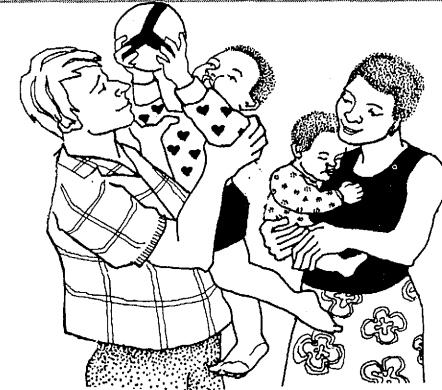
Ukukhulela emndenini komntwana osele dengwane kungamenza okuba azizwe engomunye womphakathi futhi kungamelapha lomntwana ekuhluleni kumezekeni kokuba dengwane.

Imindeni eminingi efuna ukulondoloza kumbi yamukele lomntwana njengowayo ayiqondi ngenqubo yokwamukela labantwana. Kunesidingo esikhulu sokufundisa umphakathi ngenqubo yokulondoloza kumbi ukwamukela umntwana.