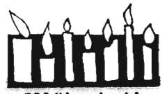
300 'Homelands' black babies